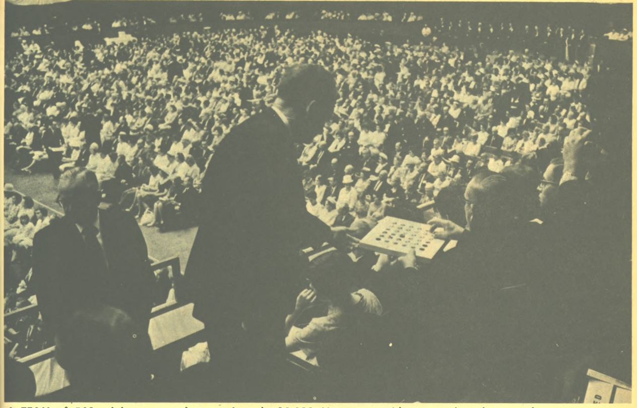
A TEAM of 560 ministers served approximately 20,000 Nazarenes with communion elements during two services Sunday morning. Although a record number received the symbolic emblems of Christ's body and blood, each person was served while Dr. Hardy C. Powers was reading a short scripture passage.