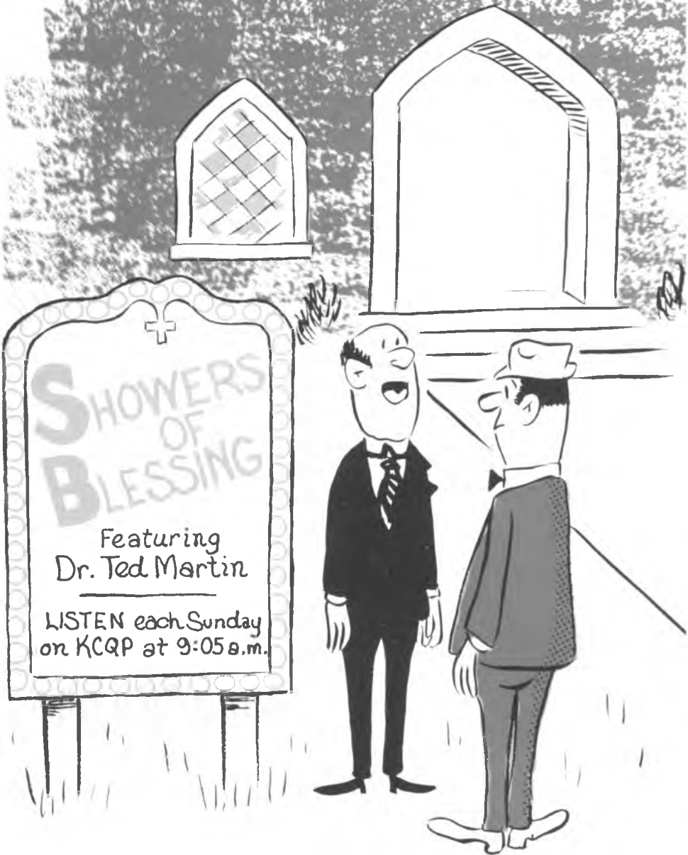
"Wha'da ya think? Is Kansas City getting too commercial?"